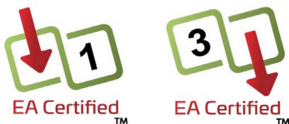
Figure 3. Ethernet Alliance marks for Powered Devices (left) and Power Sourcing Equipment (right).

PoE is designed to run over standard category twisted pair structured cabling. However, adding these high-power signals to a cable carrying high-speed data places some additional requirements on the cabling.