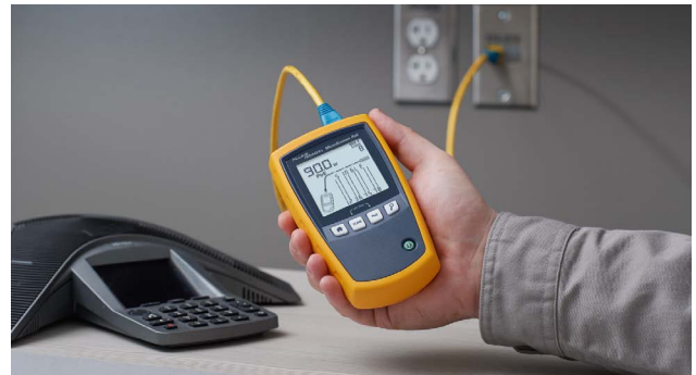
Figure 5. The MicroScanner PoE can detect the power offered by the PSE plus the network's speed, and features a suite of cable testing features.

Pick the right equipment, certify the cable's capable and then make sure your tech can check and troubleshoot the installation and your PoE project will go smoothly.