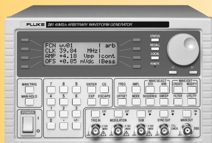
281 Waveform Generator