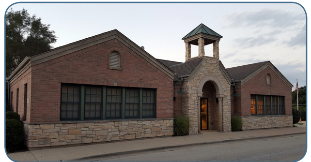
Safety Village of Lemont

Of course, all of the EAGLES sites explore each and every community SEASPAR serves, so participants at the new site will have countless opportunities to enjoy their time throughout the area. See just a few of the fun activities our current participants have experienced in our continually updated EAGLES Adventures album on Flickr!