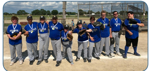
Spartans White Team

SEASPAR's two Softball teams competed at the ITRS Softball Tournaments on July 15. The Spartans Blue Team took gold in its division, winning each of its games by 10 points. The Spartans White Team took silver in its division, winning its first game in a shutout but losing its championship game by one point. Both teams are ready to compete in the Special Olympics Regional Qualifier in Joliet on August 5 with the goal of advancing to the State tournament in September!