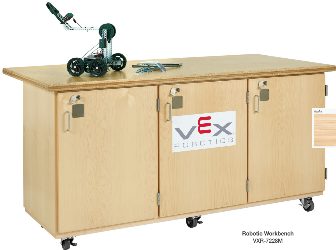
Robotic Workbench VXR-7228M