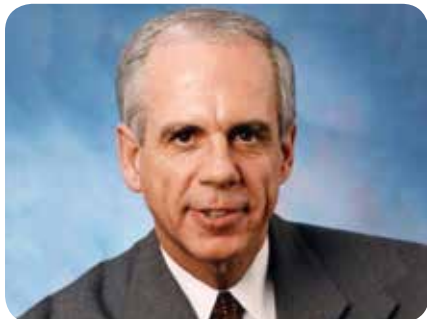
The Honorable Anthony "Tony" Coelho