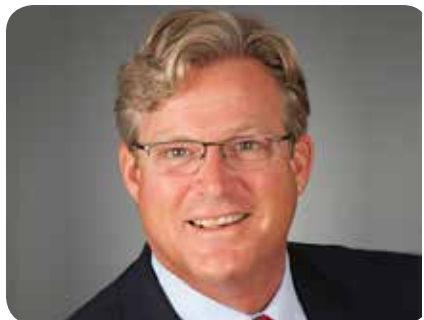
Ted Kennedy, Jr.