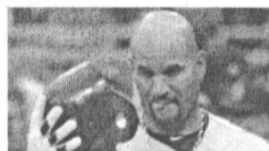
Baseball's 2011 walk-year all-stars