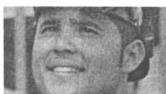
Top MLB rookies to watch in 2011