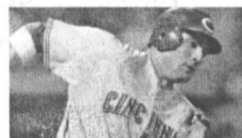
MLB stat zone

The king of the baseball stat mavens is taking center stage.