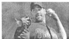
MLB old faces, new places 2011