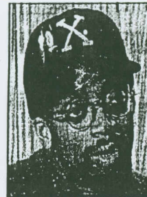
Spike Lee "Strat-O-Matic nut"