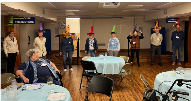
Fun at the October gathering of Saints and Sinners