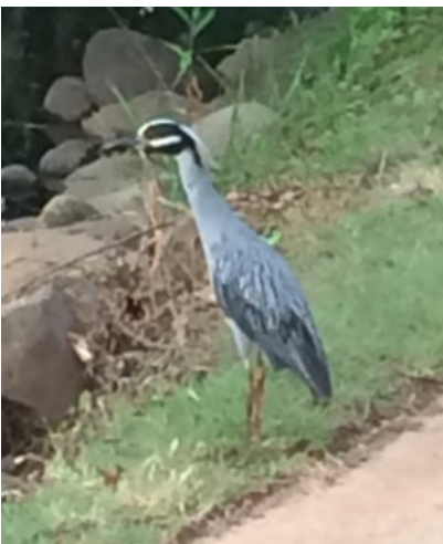
Yellow-crowned night heron visiting Bud Cramer Park in Huntsville.

On my run through Bud Cramer park this morning, I noticed several plastic bags floating in the creek. As I often do, I paused my run and picked several items of trash out of the creek and placed them in the trash can. One consequence was wet feet for the rest of my run. Another consequence was that I had a short conversation with a lady sitting in the park. I don’t know her circumstances; she could be one of the homeless people I often see in the park early in the morning, or from the nearby low-income housing, or she could be a crypto millionaire. She thought I was doing a good thing and people should not throw trash in the creek. I agreed and said keeping the creek clean was good for the kids who play there and for the ducks and herons who live there. It felt good to do a bit of clean-up, but the brief connection I made with a fellow child of God who also cares for His creation raised my spirits even more.