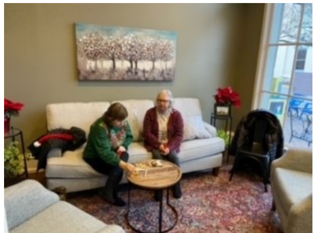
Ladies' Holiday Social