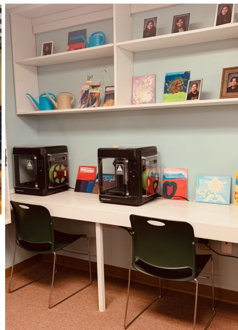
Right: a picture of the 3D stations built as part of Daniel's project at HICLC.