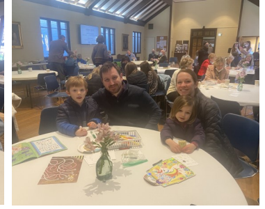
Nativity friends enjoying some of the treats prepared by the cookbook committee at Second Sunday