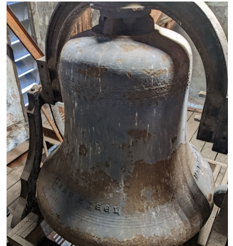
Above: Pictures from inside the bell tower.