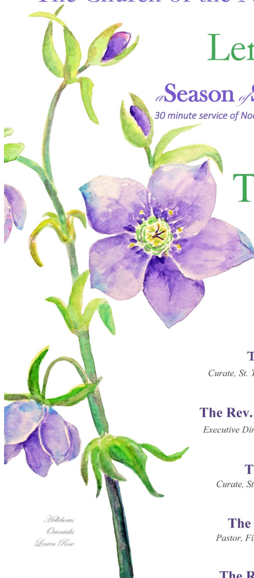
Helleborus orientalis Lenten Rose

Sr. Pastor Weatherly Heights Baptist Church, Huntsville, AL