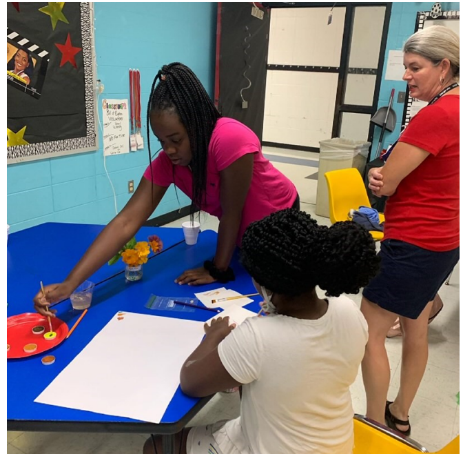
Below: Huntsville Inner City Learning Center at the Greene Street Market as part of their summer camp expeditions