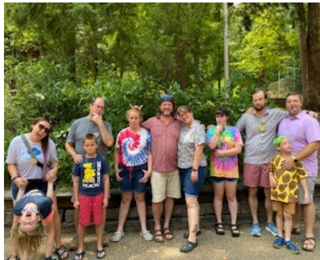
The Nativity crew being silly at Primary 2 Session

All of this love at the camps I have been to this summer is part of our call to "Go in peace to Love and serve the Lord". As summer comes to an end and children and teachers go back to school, some people will still be living at camps and there will still be ways to serve. I look forward to you joining in the journey of going forth to love and serve the Lord.