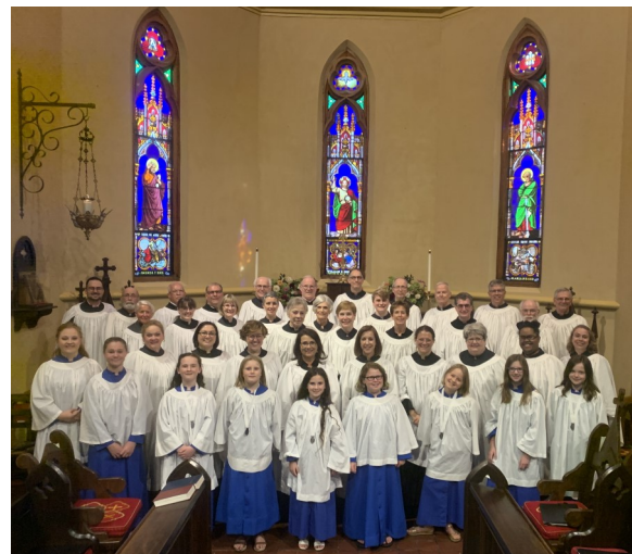
Nativity Choir 2019

COVID protocols will be in place during rehearsals and may change throughout the year depending on the progression of the pandemic.