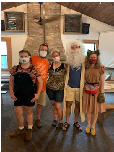
More fun photos of Nativity families from Primary 2