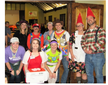
Common Ground having fun at the October Spaghetti Supper