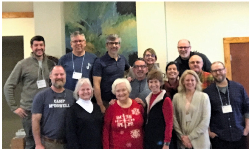
Vestry members at the annual Vestry Retreat at Camp McDowell in January.