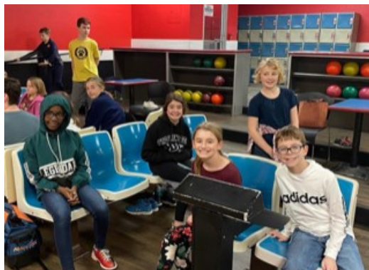
JYC Bowling fun!