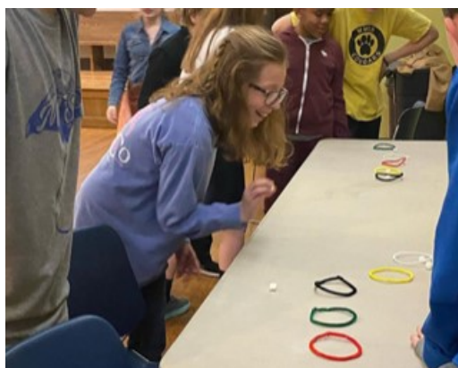
EYC Winter Olympic games