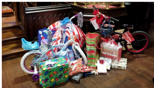
Several of the gifts collected by parishioners for the FOCAL program.

God's family at the historic Church of the Nativity is joyfully and energetically committed to sharing Christ's love and healing by proclaiming the Good News of the Gospel through worship and service to the world.