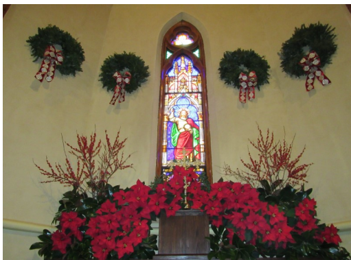
The beautiful arrangement done by the Flower Guild for Christmas Eve.