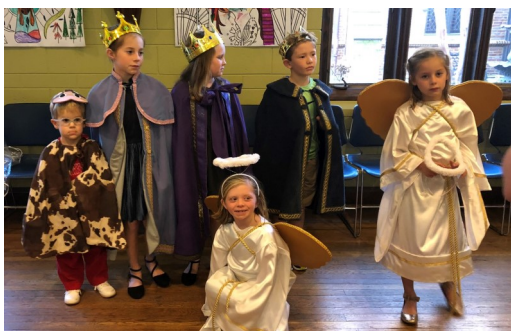
Preparing for the pageant.