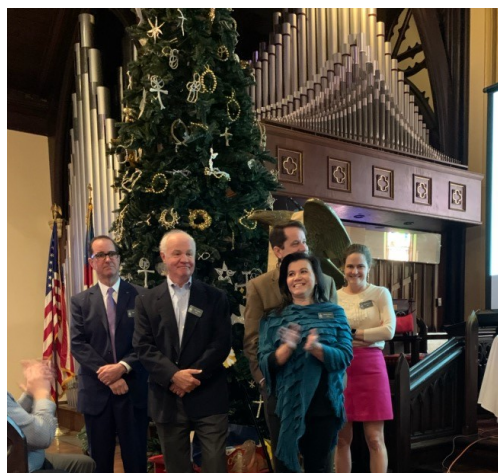
Outgoing Vestry members being recognized at the Annual Parish Meeting.

CLICK HERE FOR THE NOVEMBER VESTRY MINUTES