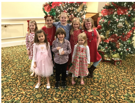
Members of the Novice Choir sang Christmas carols at Brookdale Assisted Living.