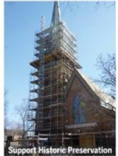
Support Historic Preservation

You will learn how the two funds are different, how they are invested, how they are utilized and other important information so you can make an informed decision when doing your estate planning.