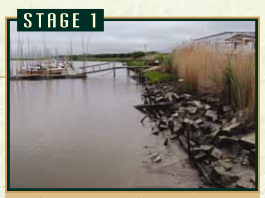
April 2010 – Rip rap had been used in an unsuccessful attempt to control erosion in Heislerville Fish and Wildlife Management Area in New Jersey along Anchor Marina.