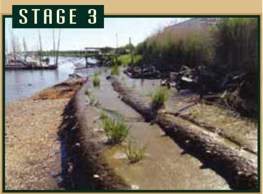
June 2010 – A few native marsh grasses were planted behind the coir logs where sediment (mud) had started to collect.