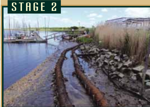
May 2010 – Coconut-fiber (coir) logs and mats were put in place.