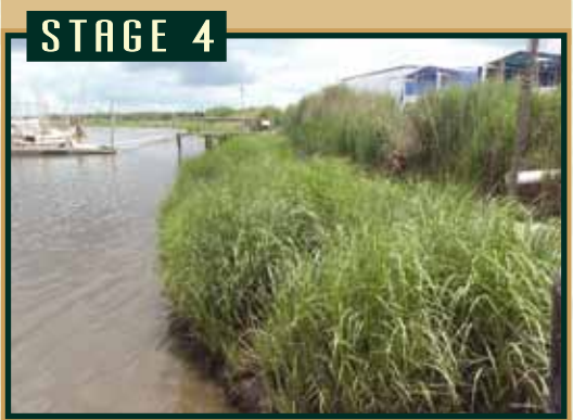
June 2011 – Just one year later, native marsh grass flourishes in the mud that had collected behind the new Living Shoreline.