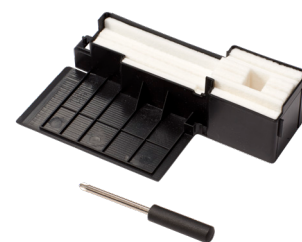
PHOTOCAKE EPSON INK PAD REPLACEMENT KIT