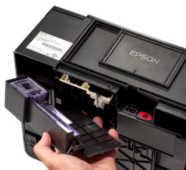
6 Remove screw and slide ink pad tray to right