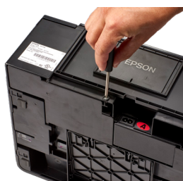
5 Set printer display side down