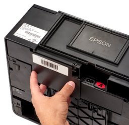
8 Insert new ink pad and replace screw