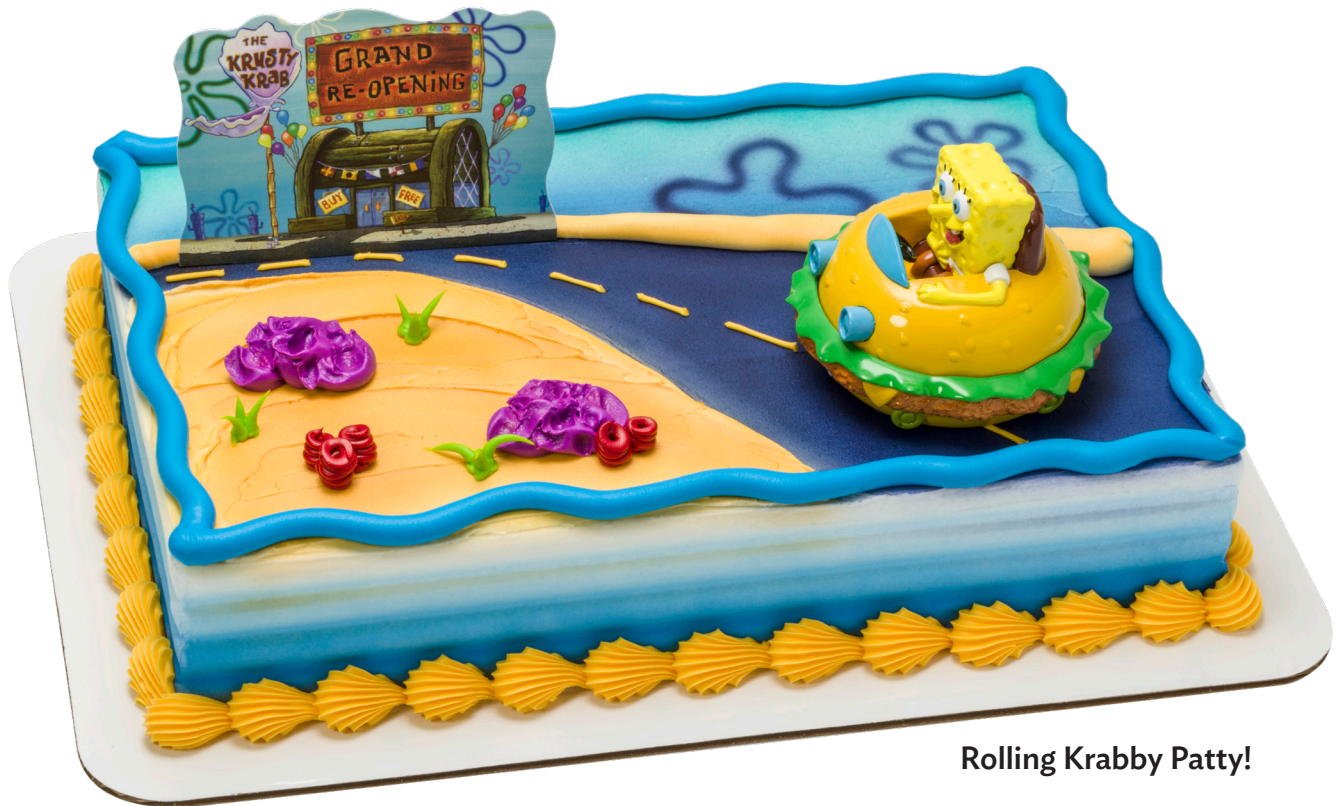
Rolling Krabby Patty!