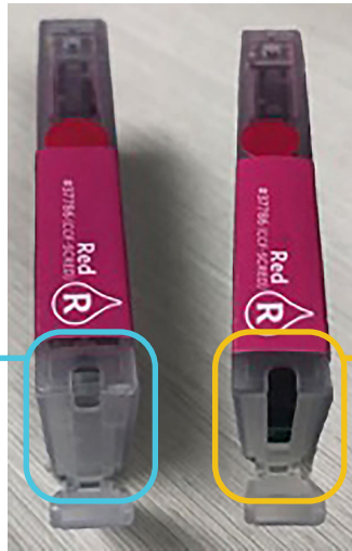
New cartridge design

If the light is not on, the ink cartridge is not inserted properly.