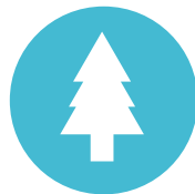
Environmental data analysis and hazard mitigation