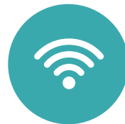
Monitoring, control, and flexibility