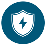
Spark risk mitigation

The western U.S. faces an elongated annual fire season and the severity of recorded wildfires is on the rise. 2