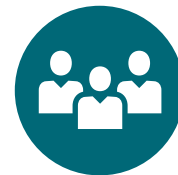
Trainers, stakeholders, and partners for ongoing service