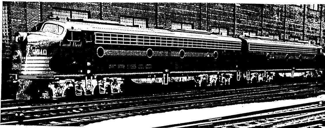
E8As 2010 "Count Fleet" & 2011 "Gallant Fox", Lindenwood Shop

The management proudly noted that the Frisco had been completely dieselized since February, 1952, with 417 units (289 freight, 23 passenger, 105 switchers) in service. As a result they were able to completely close 14 roundhouses, partially close 11 more, retire 26 coal chutes, 87 fuel oil tanks, and 231 water tanks. Between 1926 and 1950, 1,099.82 miles of main and branch line had been abandoned, considerably improving the railroad's efficiency. In 1954 the Frisco owned 26,149 freight cars (including cabooses), 359 passenger cars of all kinds, and 1,677 company service cars (including 12 business cars).