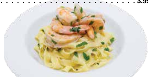
Baked Ziti . . . . . 12.50