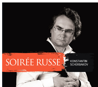
TP1039114 Konstantin Scherbakov (piano)