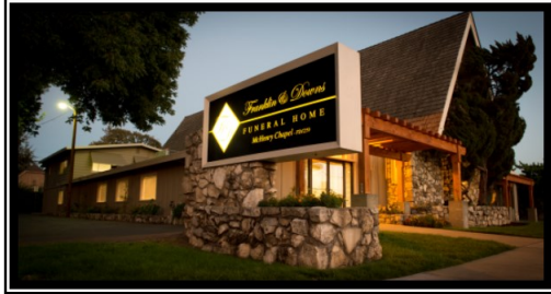
McHenry Chapel - FD1259 1050 McHenry Ave. Modesto, CA 95350 (209) 529-5723