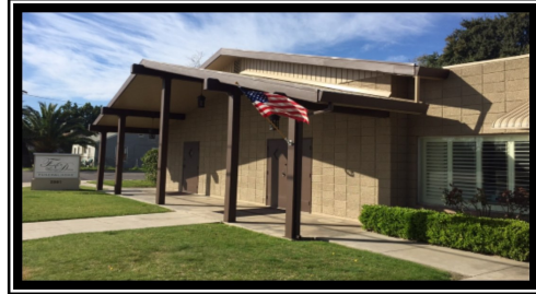
Ceres Chapel - FD1202 2561 5th Street Ceres, CA 95307 (209) 537-4711