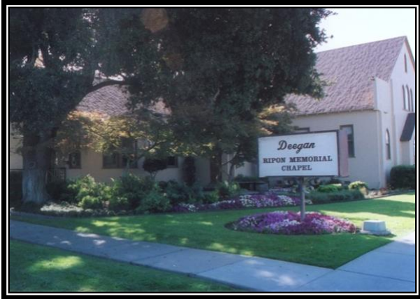
Deegan Ripon Memorial Chapel Ripon Chapel - FD~987 111 S. Palm Avenue, Ripon, CA (209) 599-3413