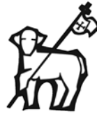
Agnus Dei or Lamb of God Represents the atoning sacrifice of Christ