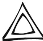
Equilateral Triangle Represents the Holy Trinity; combined with a circle, represents the eternity of the Holy Trinity