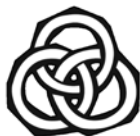
Three Entwined Circles The three persons of the Trinity—Father, Son, and Holy Spirit; the circles are entwined to show three distinct persons, yet one eternal God.