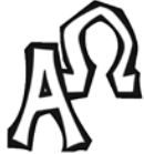
Alpha and Omega Greek for the Beginning and the End