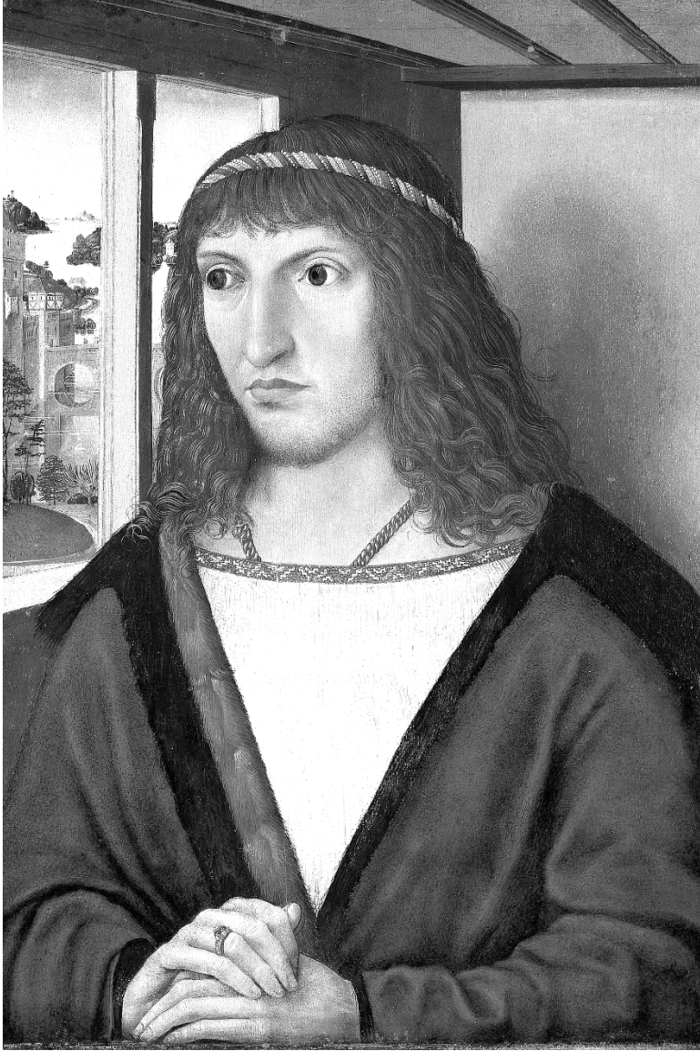
Figure 1: Frederick III of Saxony c. 1486 by Nuremberg Master