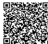
Fall Events Help