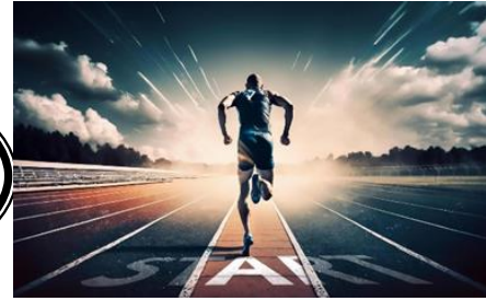
English Standard Version

12 Not that I have already obtained this or am already perfect, but I press on to make it my own, because Christ Jesus has made me his own. 13 Brothers, I do not consider that I have made it my own. But one thing I do: forgetting what lies behind and straining forward to what lies ahead, 14 I press on toward the goal for the prize of the upward call of God in Christ Jesus. 15 Let those of us who are mature think this way, and if in anything you think otherwise, God will reveal that also to you. 16 Only let us hold true to what we have attained.