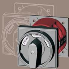
Rear mounting + locking