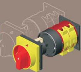
Door coupling + main switch with emergency