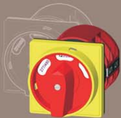
Front mounting + locking