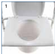
1. 16" wide snap-on seat for added comfort and support