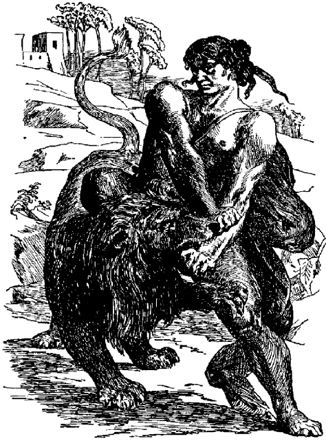
Samson and the Lion