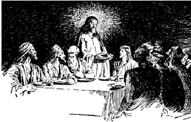
This is my body