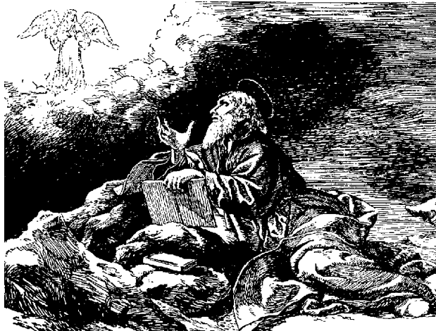
The revelation given to John