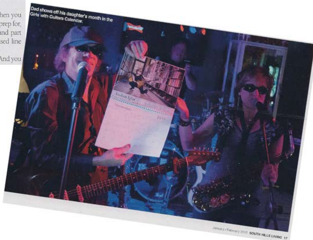
Dad shows off his daughter's month in the Girls with Guitars Calendar.