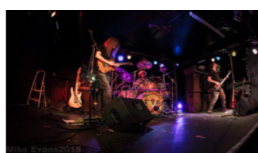
The Aristocrats / Godsticks →