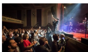
The Pineapple Thief / Godsticks →