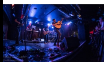
The Pineapple Thief / Godsticks →