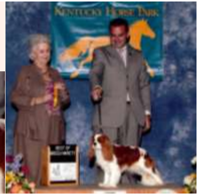
AKC CH/ GRAND CH/ CASTLEKEEP SUGAR DADDY