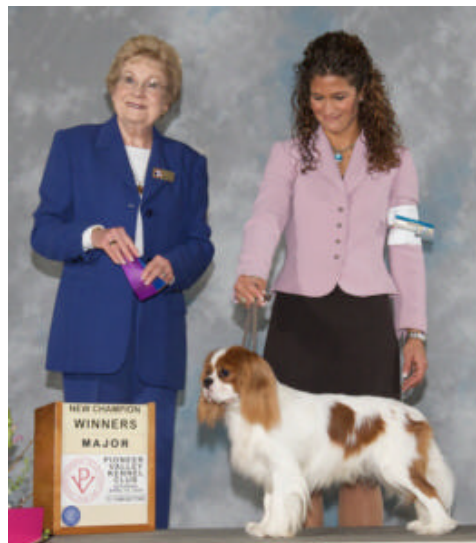
CH Rock Cliff Farm Double Edge (Ch Northwoods Also In Tri x Rock Cliff Farm Mdmsll Maxine)