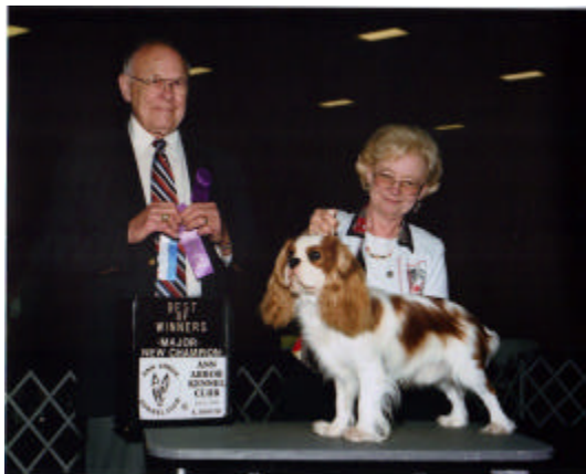
CH Droleus In It To Win It JW Tomnil Cream of the Stars x Wightisle She's Magic