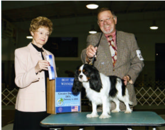
CH Rock Cliff Farm Allan (CH Northwoods Also In Tri x Rock Cliff Farm Dutchess)