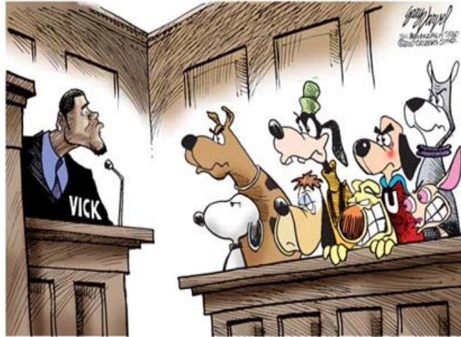
Michael Vick's worst nightmare.....

Healthy Pet Products, Inc. www.healthypetdiet.com