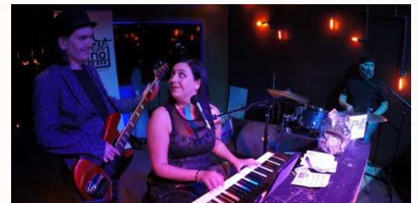
Any size event, casual or formal

We also can provide a wireless mic for announcements, an iTunes mix for dinner music, custom request forms, and other special requests for an added fee.