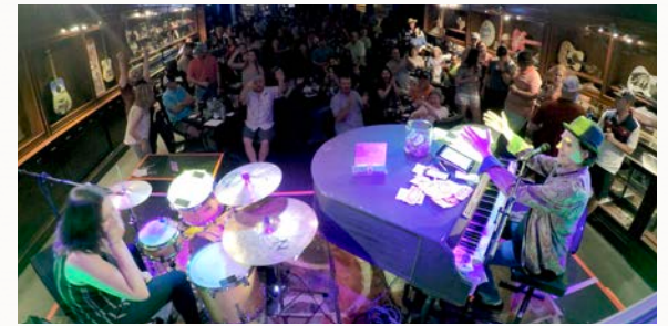
Our most popular show is one piano player and a drummer.

This is the most popular option we offer. Great for dancing and keeping the energy up for any event. It gives the feel of a band with the spontaneity of taking requests.