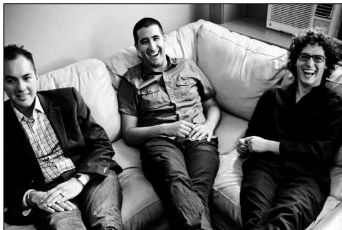
Tampa Bay-based La Lucha is the house rhythm section for the Sarasota Jazz Festival.