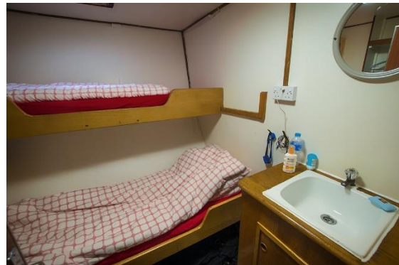
A double cabin aboard Lady of Avenel.