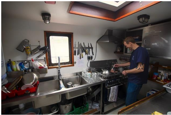
The galley aboard Lady of Avenel

Meals are prepared in the modern upper deck galley; these are of a high standard and prepared by our own chef. Meals, tea and coffee are included in the price of the trip.