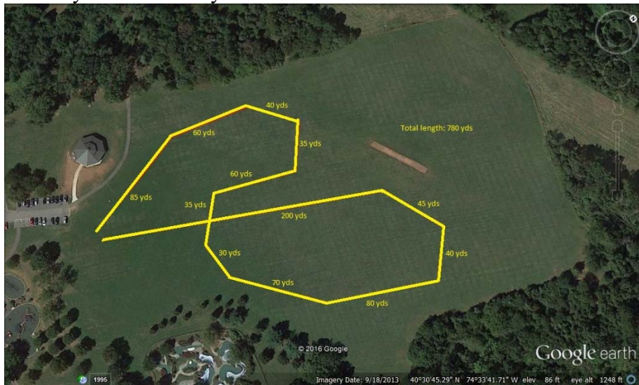
Saturday Course - 780 yds.