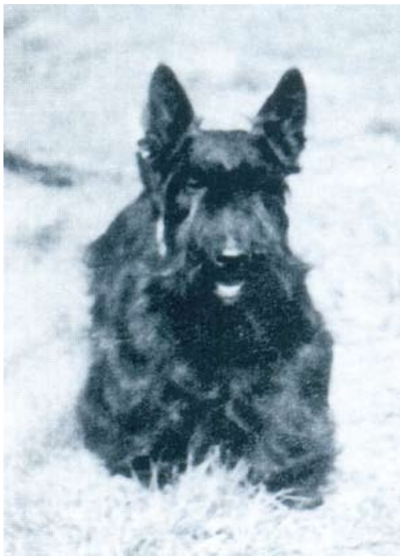
The Scottish Terrier Scotch Rose