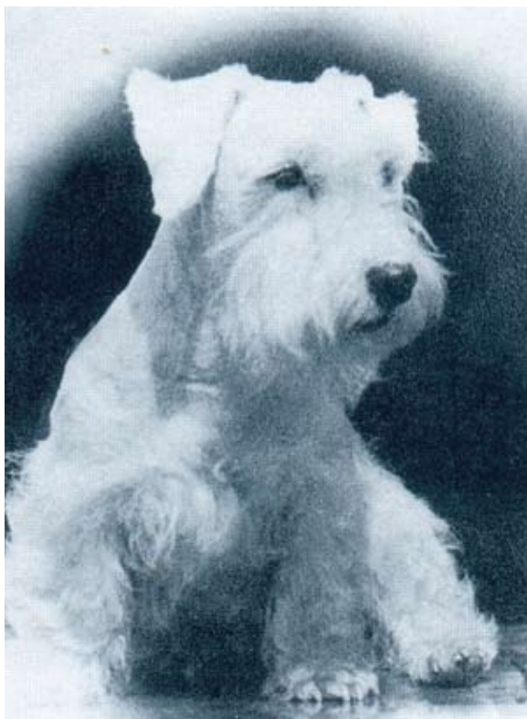
The Sealyham Terrier Bugarier Urquelle