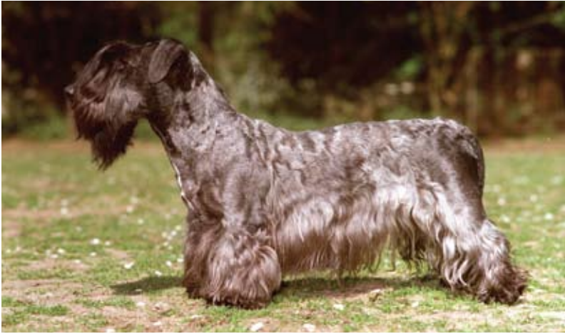
Diana Bohemia Regent (Chram Kvitko x Alida z. Alenciny) was the first non-British Cesky Terrier to win BOS at Crufts.