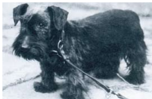
Diana Lovu zdar (Balda Lovu zdar x Scotch Rose)