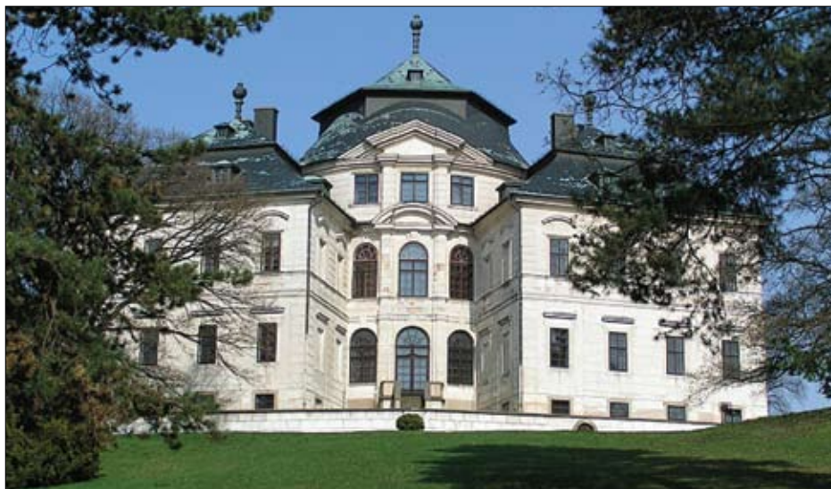
Castle Karovà Koruna