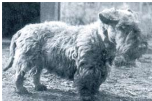
Balda Lovu zdar (Buganier Urquelle x Scotch Rose) born in 1950