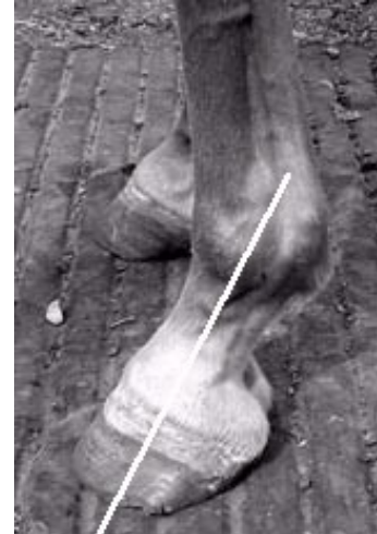
Photo 4 – Right This hoof shows the “Rule of Thumb” for angle, with the angle of the hoof matching the angle of the pastern. This is correct for most horses. (There is a slight flare on the hoof that could be removed but does not affect the way of going.)

The rule of thumb is that the angle of the hoof should match the angle of the pastern (see photo 4). This works with most horses, but the rule does not apply in every case. One year our stallion, RTP Casino, appeared footsore. We pulled him from the upcoming show and the vet examined him, noted that he has more upright pasterns than many Peruvians, and noticed that we had worked very hard to