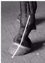
Photo 5 – Left - Hoof balanced by x-rays with very slight broken angle, low heel and short toe. This is the same hoof as in Photo 1, showing ideal frog health and heel support.

The rule of thumb is that the angle of the hoof should match the angle of the pastern (see photo 4). This works with most horses, but the rule does not apply in every case. One year our stallion, RTP Casino, appeared footsore. We pulled him from the upcoming show and the vet examined him, noted that he has more upright pasterns than many Peruvians, and noticed that we had worked very hard to