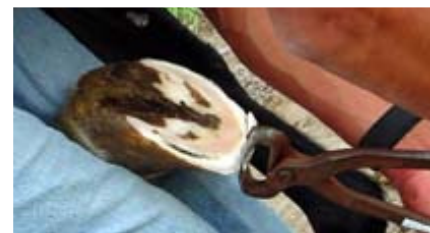
Photo 6 – Snubbing the toe back creates a hoof much like a wild horse.