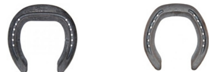
Natural Balance Shoes front and rear