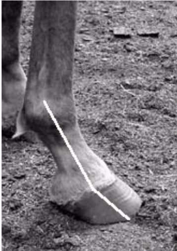
Photo 3 – Left -- Same hoof as Photo 2, viewed from the side. This hoof needs to be trimmed. A noticeable broken angle has occurred due to the fact that most Peruvians grow toe more than heel, and there is a tendency to underslung heels.