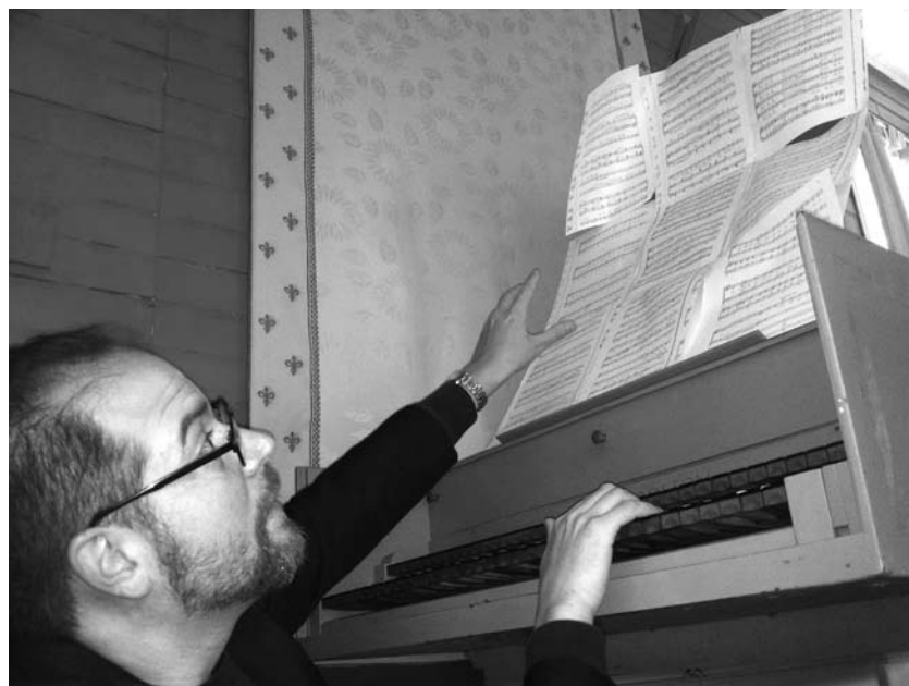
Figure Two: no page turns, vertical page layout

Over the years, I've asked myself why harpsichordists aren't expected to memorize, and, like many harpsichordists, I'd been asked by audiences why I didn't play from memory. I know of many reasons! Memorization keeps the player from free ornamentation. It isn't historical. Bach is too hard to memorize. We're too busy with all of the continuo playing. The world's greatest harpsichordists don't memorize. But the best excuse of all is that we don't have to . This is a great excuse, and I've used it so many times that I even recommend it!