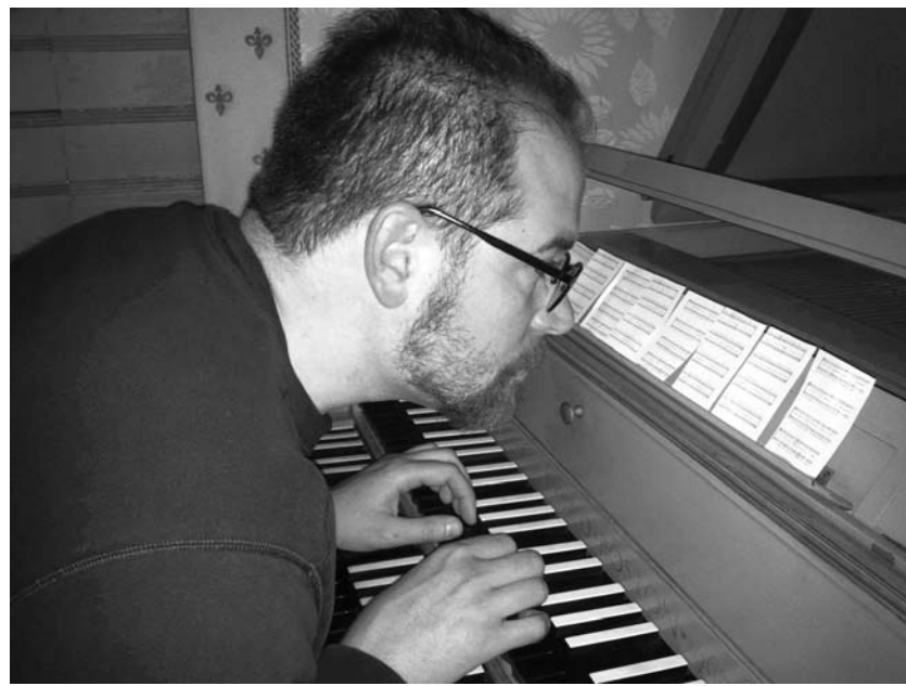
Figure Four: no page turns, miniaturization layout

your students to play from memory. We need a sea change to meet the standard that is expected on the modern concert stage—because we don't have to is no longer an excuse. ■