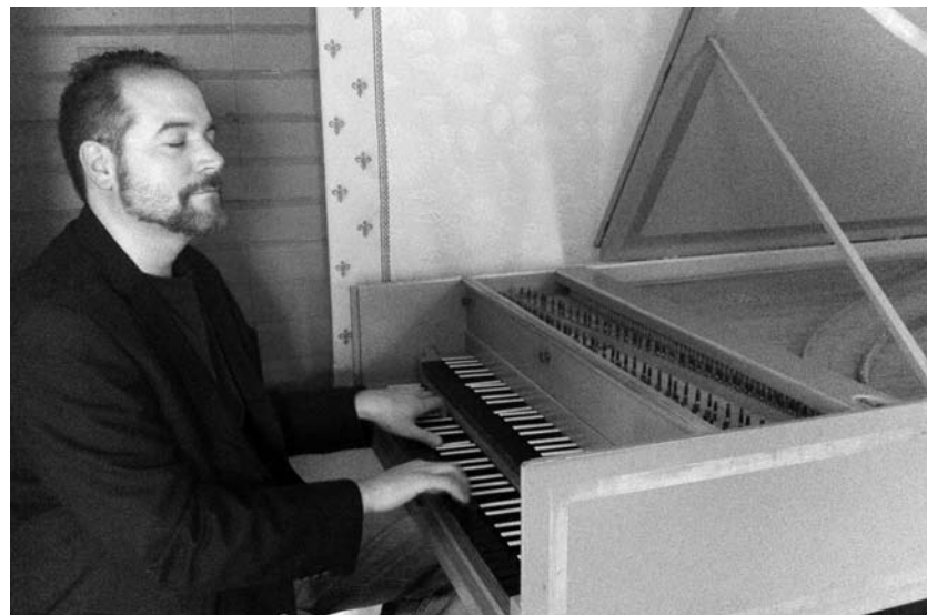
Figure Five: no page turns, no music, no glasses, no music desk, no lighting, no problem, Zen