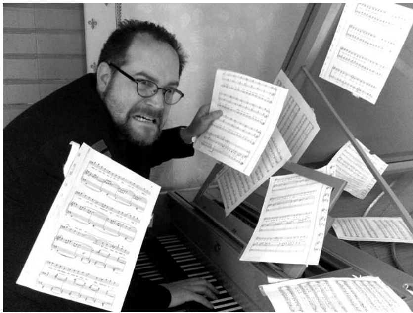
Figure Three: page turns, loose leaf layout