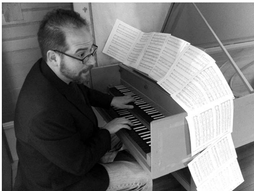
Figure One: no page turns, horizontal page layout