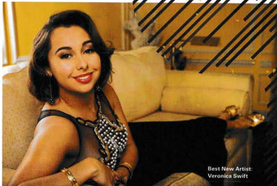
Best New Artist: Veronica Swift

Straight No Chaser GuitarWank Jazz Bastard The Checkout