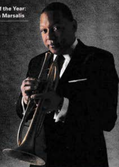
Artist of the Year: Wynton Marsalis

Winners are bolded; runners-up are listed below in order of number of votes (an asterisk * denotes a tie). When casting their ballots at JazzTimes.com, readers were asked to focus on artists' achievements occurring between January and December 2019.