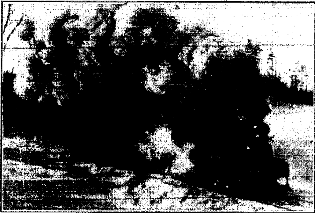
A LOGGING TRAIN IN THE NORTH. Hauling logs out of the woods at Webbwood.