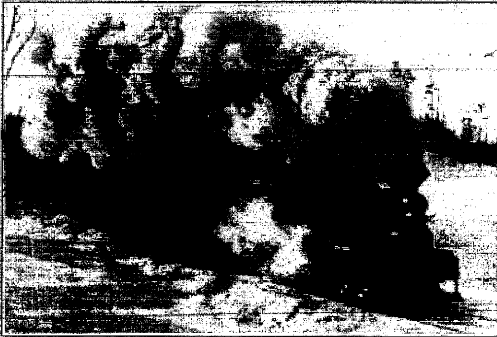
A LOGGING TRAIN IN THE NORTH Hauling logs out of the woods at Webbwood.